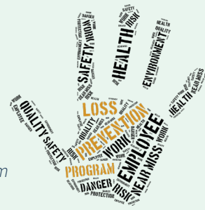
Ketek's Loss Prevention Program

Our business operations interact with a wide community of employees, clients, First Nations, governments and the public. In all our engagements, we reinforce the value of our products and services by delivering through understanding of stakeholder interests. Common to all are excellence in health and safety, employment and training.