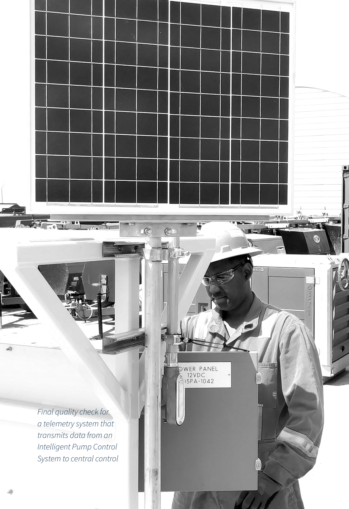
Final quality check for a telemetry system that transmits data from an Intelligent Pump Control System to central control